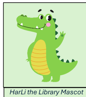
HarLi the Library Mascot

Heritage Hub is a genealogy resource that explores family history with the premier collection of U.S. obituaries and death notices for in-depth genealogical research from 1704-today. Heritage Hub helps you identify relatives, uncover new information and potentially unknown family members. Includes deep coverage from all 50 states, hard-to-find content from the mid 1900's, and original obituary images. Access is available 24/7.